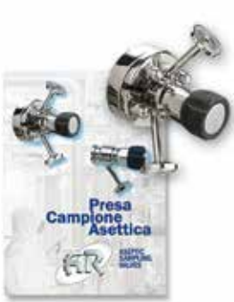
ASEPTIC SAMPLING VALVES