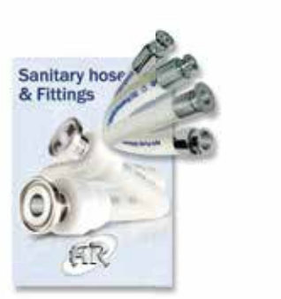
SILICONE HOSE & FITTINGS