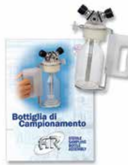
SANITARY SAMPLING BOTTLE