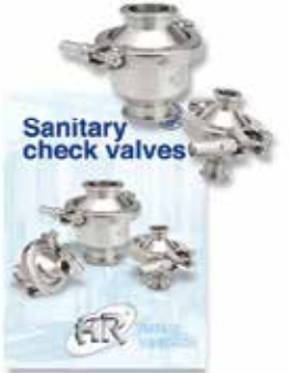
SPRING CHECK VALVES