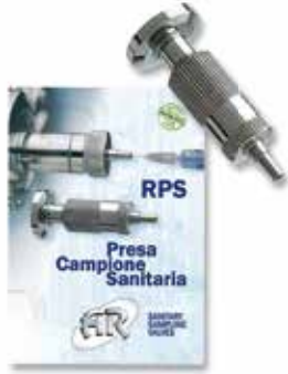
SANITARY SAMPLING VALVES