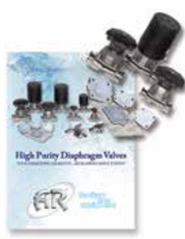
ITT DIAPHRAGM VALVES