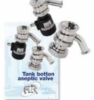
TANK BOTTOM ASEPTIC VALVE