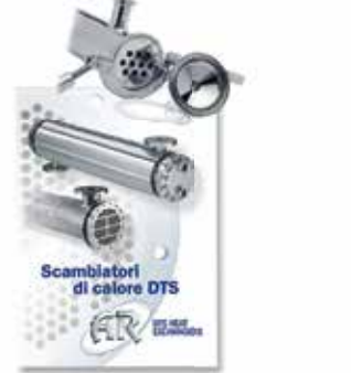
DTS HEAT EXCHANGERS