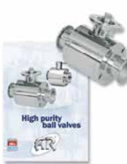
HIGH PURITY BALL VALVES