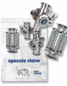
SIGHT GLASS-FLOW INDICATOR