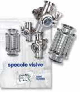
SIGH GLASS-FLOW INDICATOR