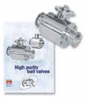
HIGH PURITY BALL VALVES