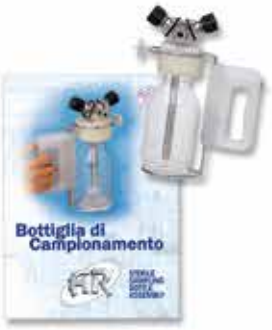
SANITARY SAMPLING BOTTLE