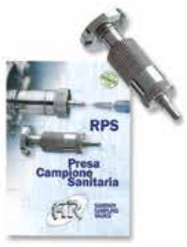
SANITARY SAMPLING VALVES