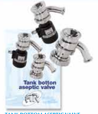
TANK BOTTOM ASEPTIC VALVE