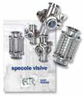
SIGH GLASS-FLOW INDICATOR